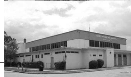
Citizens across the district are lending their voices to help determine the future of Hungerford.