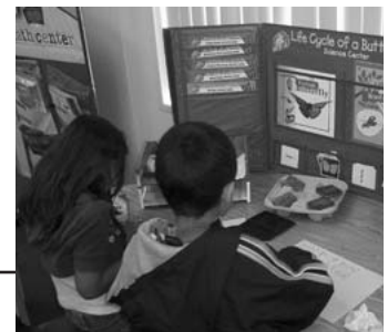
A Foundation teacher grant funded this Cypress Springs Science Lab interactive insect learning project.