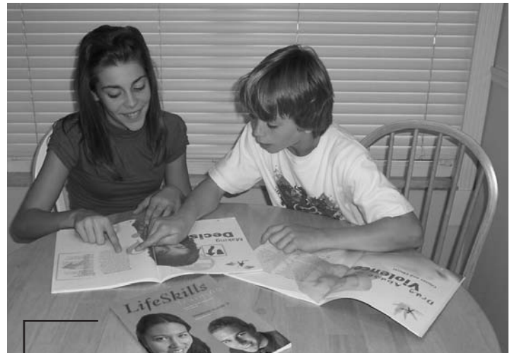
Ocoee Middle School students are learning about things like dealing with emotions and avoiding violence through a new LifeSkills Training curriculum.

Thanks to a $1.3 million grant from the Public Education Network, the Foundation is taking Middle School Kids into the classroom and beyond. Last year, the Foundation provided LifeSkills Training curriculum to the district's 39 middle schools in collaboration with the district's SAFE department. The program provides instruction for teachers and students. It addresses positive social interaction, understanding different emotions, the effects of substance abuse and prevention strategies, and improving self-esteem. Throughout the next two years, the Foundation will continue to provide professional development to educators and community partners, engaging everyone from parents to youth organizations. Work is underway to bring together students, parents, teachers, administrators and citizens to talk about the issues our student face today, as well as to promote community resources.