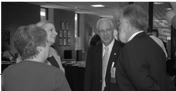
Guests enjoy a reception for the Foundation's 20th anniversary. Following the reception, the Orange County School Board recognized the Foundation for its decades of work supporting student achievement.

Today, with thousands of supporters, core student-enrichment programs, a major community engagement initiative and $2 million provided for district programs and schools each year, the Foundation is helping to create a brighter future for every student.