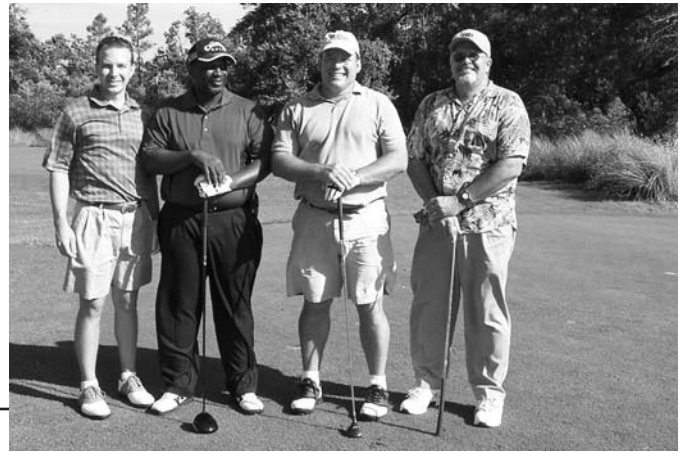
Hitting the links, impacting student achievement. These golfers were among the 250 people who played in the Foundation's Fore Our Schools Golf Tournament and raised more than $130,000 to support the Foundation's work.

On September 21, more than 250 golfers strived for birdies and eagles at ChampionsGate Golf Club while going all out to support public education in Orange County. And the players and corporate sponsors were champions themselves as more than $130,000 from this golf tournament benefit was raised to support the Foundation's work and programs. Since this event's inception eight years ago, the Foundation has raised nearly $750,000.